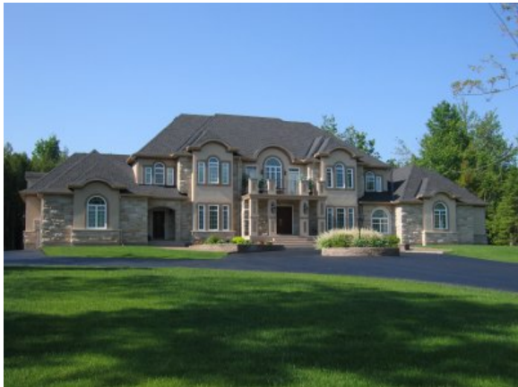
7 Bedroom 2 Storey in Manotick Rideau Forest